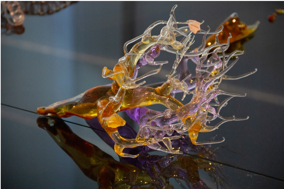
Christian Fogaroli, Pillplants (detail), 2024, series of nine blown glass sculptures, plant extracts, variable dimensions, unique.