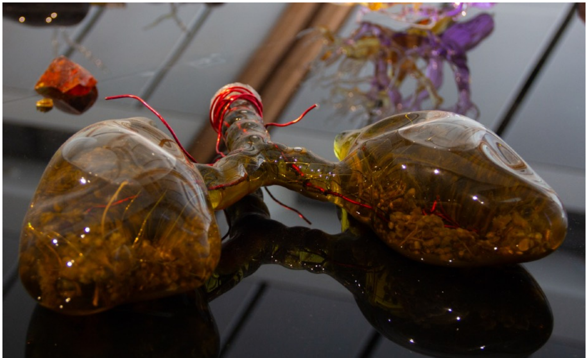
Christian Fogarolli, Pillplants (detail), 2024, series of nine blown glass sculptures, plant extracts, variable dimensions, unique.