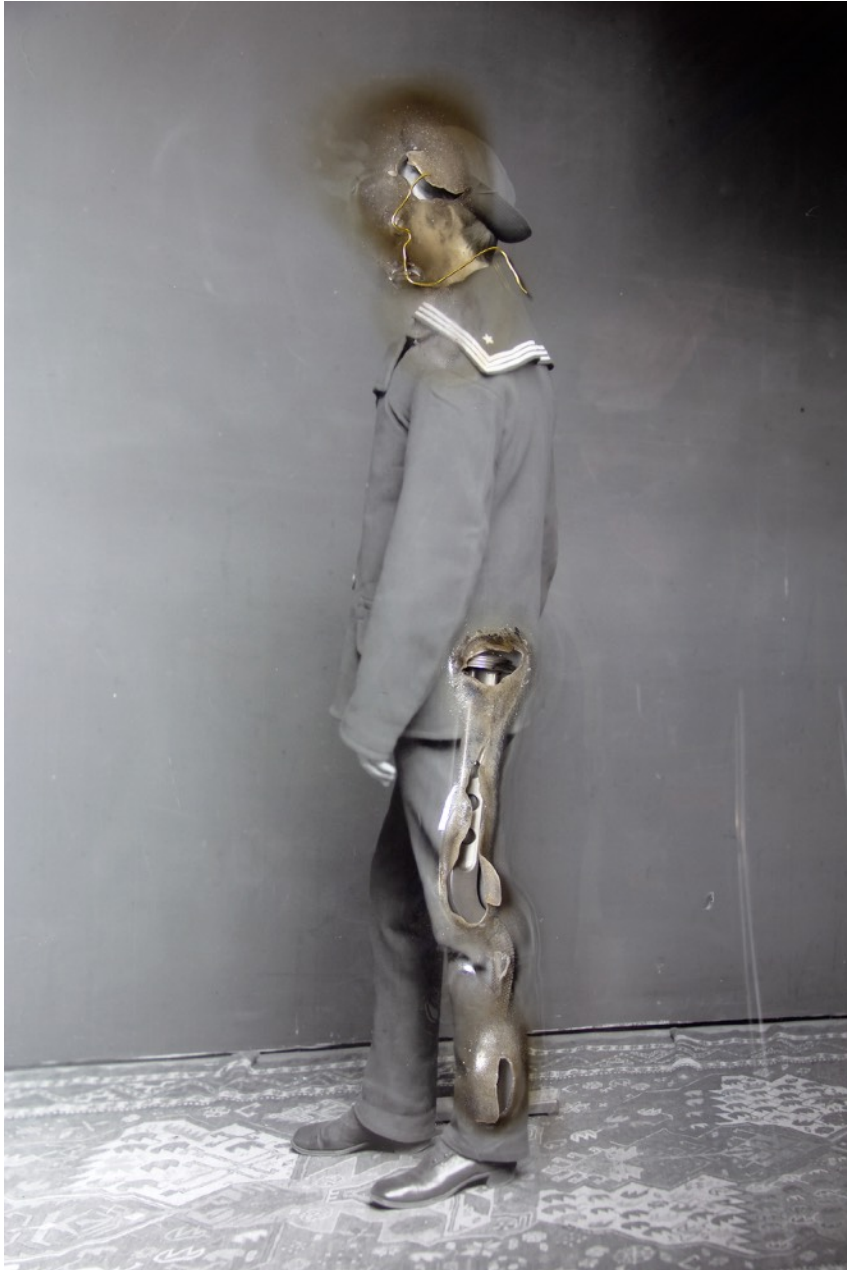
Christian Fogarolli, Ancrage , 2025, pigment print on Hahnemühle cotton paper, mounted on alu-Dibond, metal, and plexiglass, 120 x 100 x 6 cm, unique.