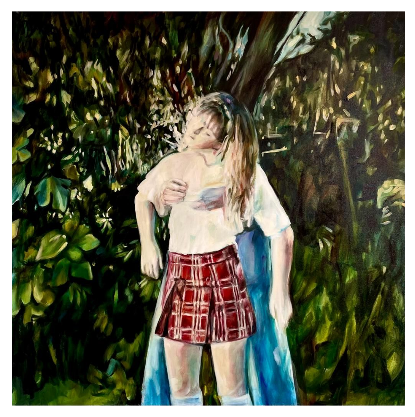
Iva Lulashi, L'offesa e l'ombra , 2023, oil on canvas , 100 x 100 cm.