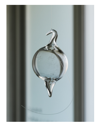
David Horvitz, Air de LA , 2020, glass, fire ashes, originally produced in 100 exemplars, 11 x 6 cm. Edition of 20 plus 5 AP. Courtesy of the artist & ChertLüdde, Berlin.

David Horvitz (USA, 1982) - Witty and poetic, the work of David Horvitz meddles with systems of language, time and networks. Eschewing categorization, his work traverses the forms of photographs, artist books, performances, the Internet, mail art, sound, and natural environments. He examines questions of distance between places, people and time and he deploys art as both objects of contemplation and as viral tools to affect change on a personal scale. He makes fictions that insert themselves surreptitiously into the real.