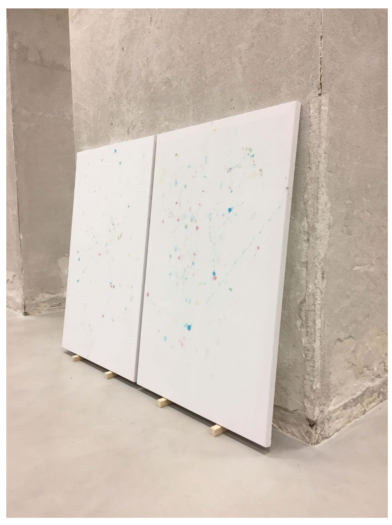
"Parappaparaparapapapara (924F1HAGN60)" 2019 120x80cm each m&m's on sheet installation view "Estate, autunno", State-of, Milan