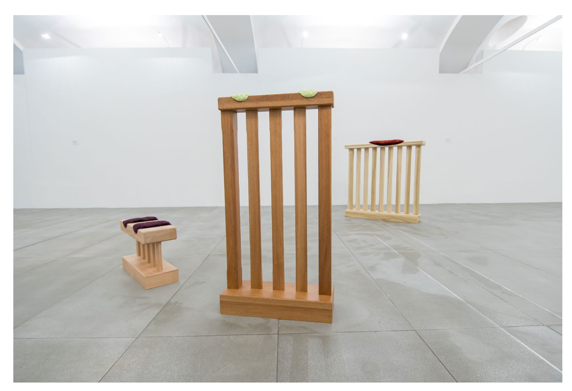
"A kind concession to disorder (ass), (forearm), (feet)" 2019 wood, velvet, cotton variable dimensions Installation view Fondazione Spinola Banna per l'Arte