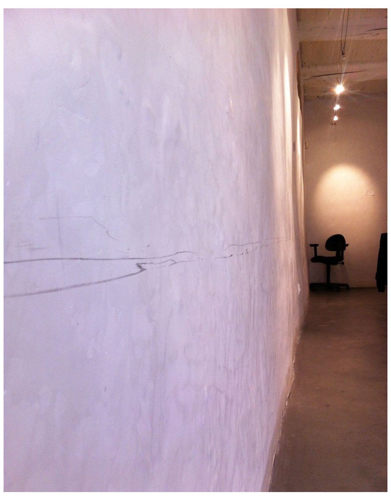
"Valzer#1" 2015 office chair, wall variable dimensions installation view La Non Maison Foundation, Aix-en-Provence